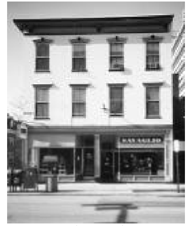
200-02 North Second Street