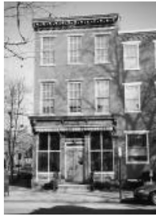
236 North Street

In Harrisburg only a pair of Jennings cast iron fronts